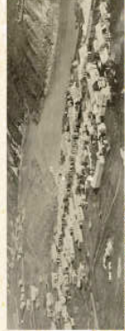
Early photographs of Clyde